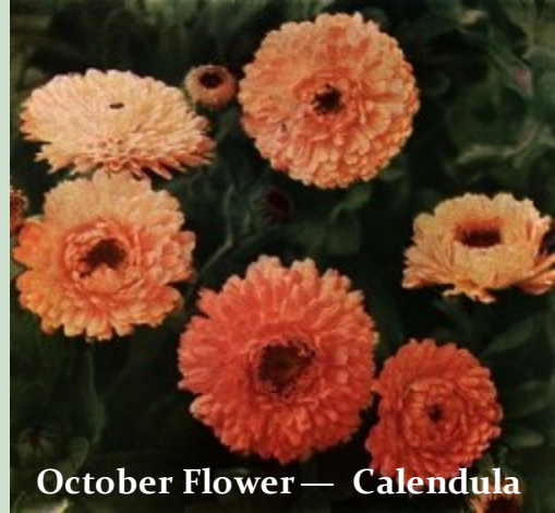
October Flower — Calendula